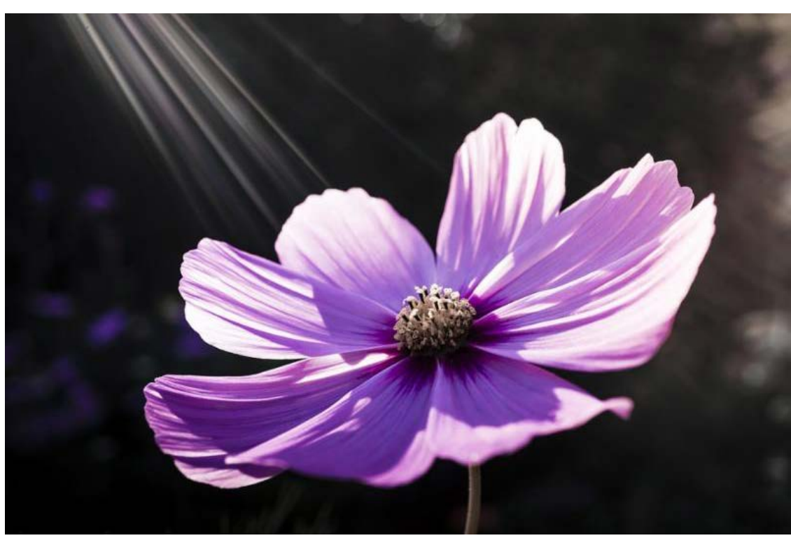
December 3, 2017 is the first Sunday of Advent. This is a special day. Celebrate with the peace and love of God. Jesus came to give you life to the fullest.

Please join the merry monks and oblates of Saint Leo Abbey for the December 3, 2017 Christmas party. Be part of the joyful family.